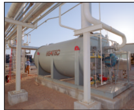
One of two Heatec 6010-50-G heaters at the Bridgeport Gas Processing Plant.

The heaters were purchased by the Pro-Quip Corporation, who built the plant for Mitchell Gas Services L.P.