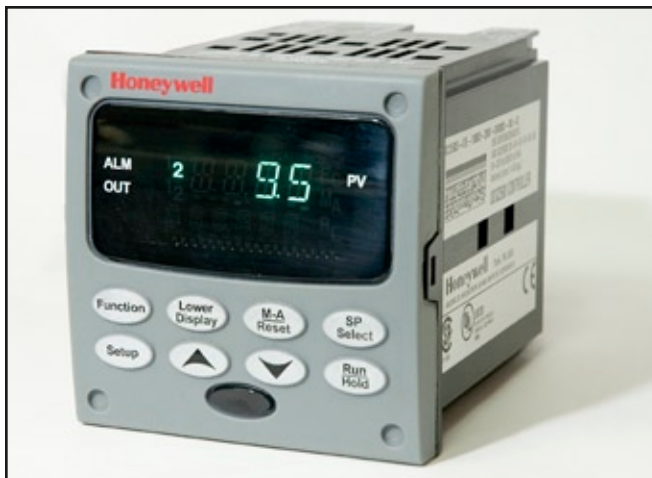
Figure 1. Honeywell Controller DC2500-EE-1000-200-00000-00-0.

Honeywell controllers purchased from Heatec are normally set at our factory and require no further setup. However, the controller can be set in the field using the information shown in Figure 3 .