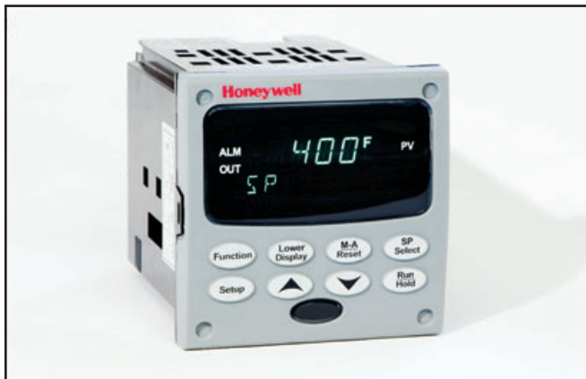
Figure 1. Honeywell UDC2500 high media temperature controller.

Consequently, if an old UDC2300 fails and has to be replaced, it should be replaced with a UDC2500, series DC2500-EE-0L00-200. The new one will fit the same