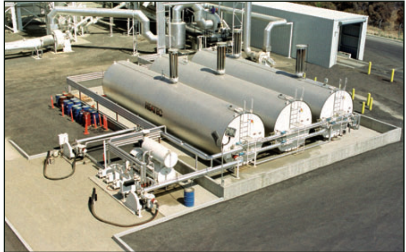
Figure 1. Heatec horizontal asphalt tanks.

This is the amount of space occupied by the heating coils. In horizontal tanks this space is relatively large. The number of