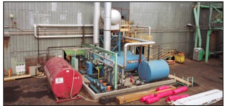
Two Heatec heaters at Eugene facility

The heaters have fully modulating burners with high turn-down ratios to allow for widely varying loads. The temperature of the