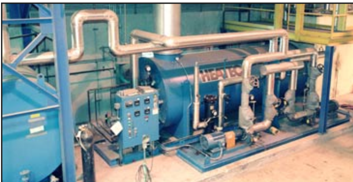
Heatec heater and pump skid at Stayton facility