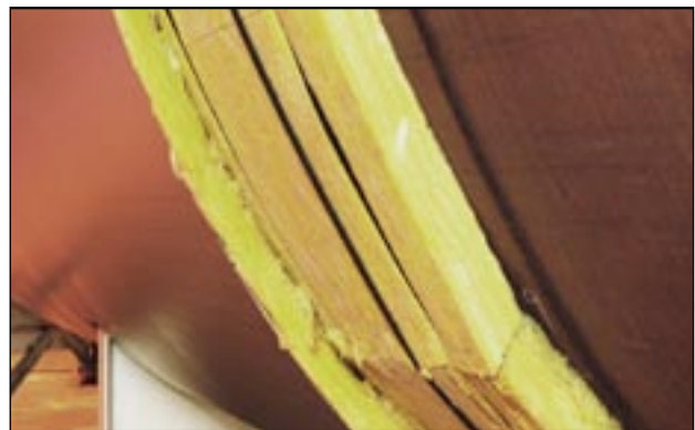
Figure 4. Heatec tanks have 6-inches of Owens Corning fiberglass insulation on sides (2 layers of 3-inches).