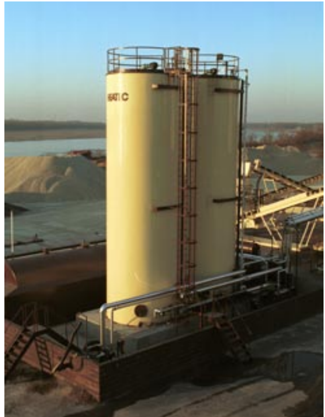
Figure 3. Heatec vertical asphalt storage tanks are insulated on top and bottom as well as sides.

Conductance is used to determine how much heat a tank loses and is the basis for the information in Figure 5. This figure compares the total amount of heat lost by tanks using insulation of several thicknesses for one year. The figure also shows the amount of fuel it would take to make up for the amount of heat lost. Carefully compare the differences in the amounts of fuel required.