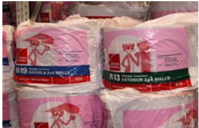
Figure 7. R-values on packages of insulation at a building supply store.

Most people have difficulty comparing three place decimals for values less than one. So, dividing 1 by k and C nearly always produces some whole numbers. (We can just round off any fractions to the nearest whole number.) Consequently, it’s easier to understand that one insulation 6 inches thick with an R-value of 22 is twice as effective as another insulation only 3 inches thick with an R-value of 11. The C values for those two insulations are 0.045 and 0.090 respectively—not easy to compare. But no matter whether you compare C values or R-values of the two, one is twice the value of the other, so their ratios are the same. It’s just easier to compare whole numbers.